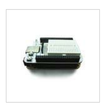
With Solderless Breadboard